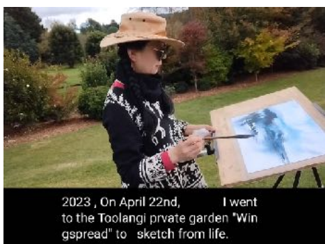
2023 , On April 22nd, I went to the Toolangi private garden "Wingspread" to sketch from life.

The chronological order of my art activities in 2023 is as follows: