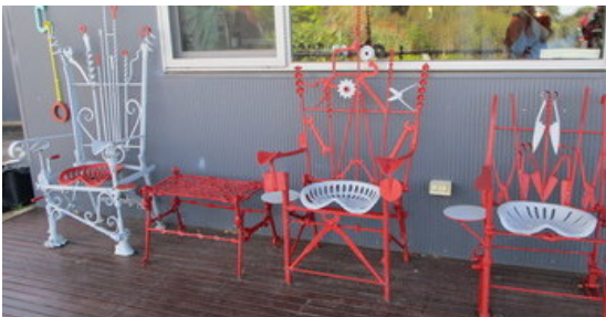
Chairs from the fire