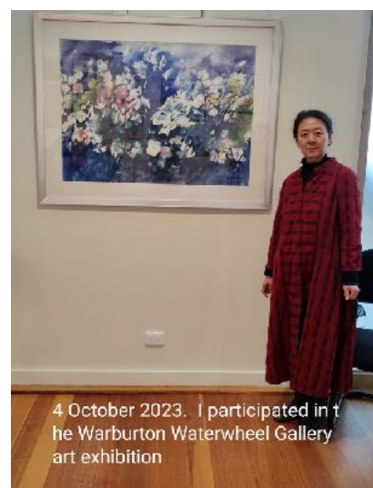
4 October 2023. I participated in the Warburton Waterwheel Gallery art exhibition