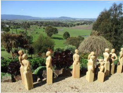
Sculpture by Graeme Foote